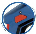
Pressure release button