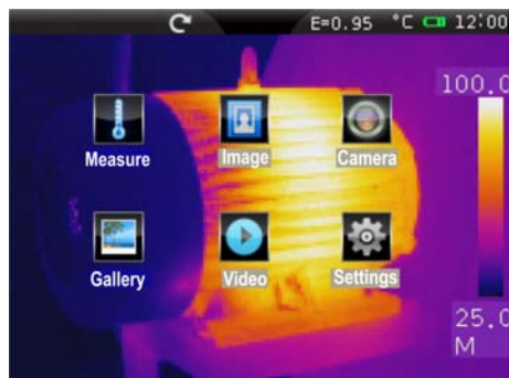
General menu with icons

The THT60 model is a professional infrared camera with capacitive touch-screen TFT color display for quick and intuitive advanced use from any kind of thermograph operator