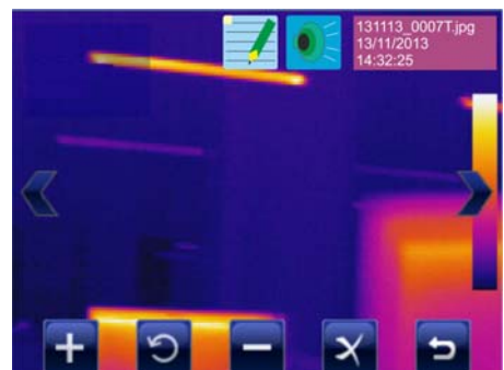
Vocal and textual annotations