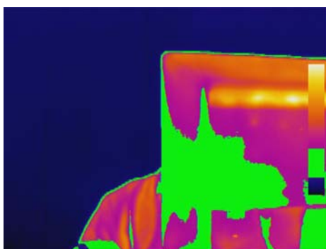
Advanced analysis: Isotherm feature