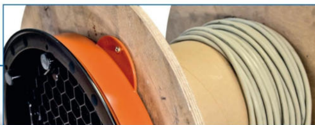
Bracket for screws