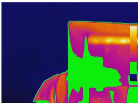
Advanced analysis: Isotherm feature