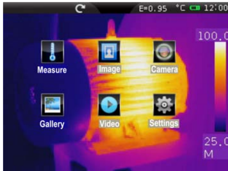
General menu with icons

The THT60 model is a advanced infrared camera with capacitive touch-screen TFT color display for quick and intuitive advanced use from any kind of thermograph operator