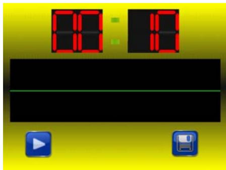
IR video creation