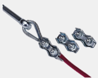
Duplex wire clamp